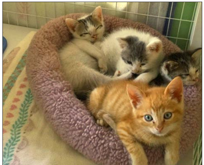
Yikes! More kittens at the Sanctuary!