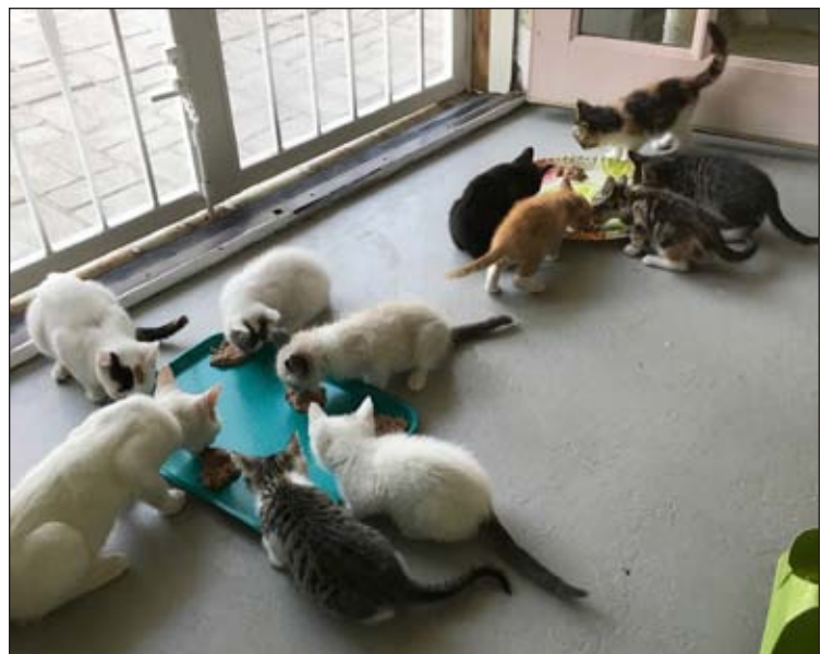
Our recent rescues in the cottage, enjoying their morning meal while the summer breezes blow in.

There is a $75 deposit, refundable when the trap is turned in after the two week borrowing period.