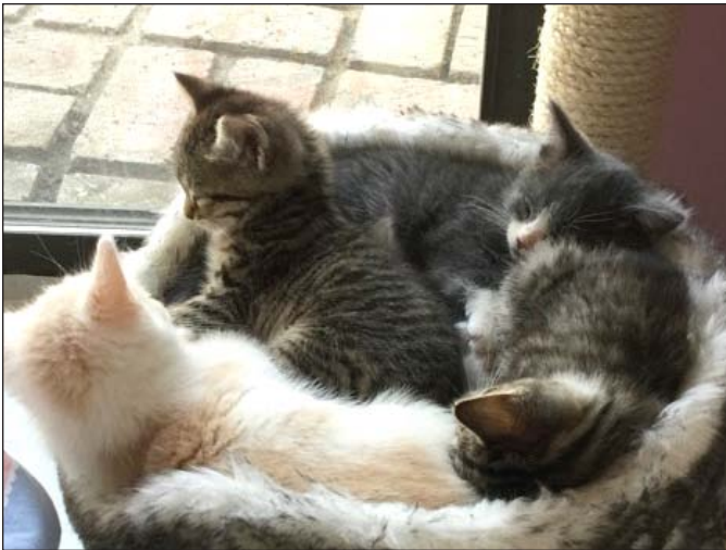
Some new arrivals, settling in at the kitten room.