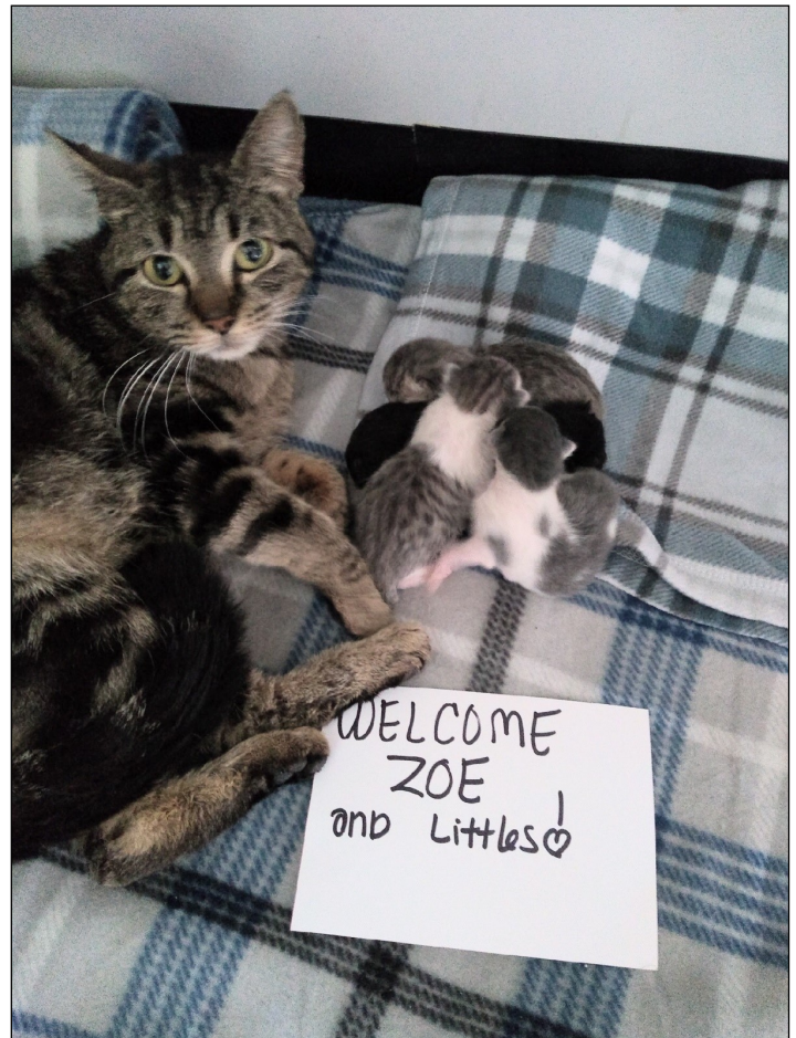
Zoe is super friendly in spite of being abandoned with her kittens. She is also a wonderful mom.