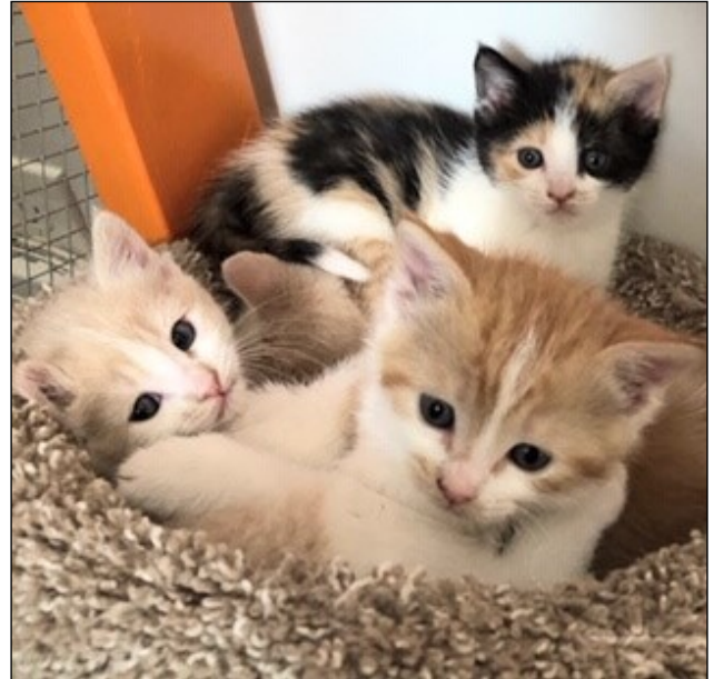
These guys have super energy and love to run up their cat trees. Mom Cali was a special rescue who would have died if left in her situation.