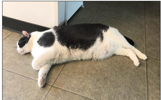
Poor eight-year-old Blue, considered morbidly obese, is now on a special diet and has lost 3 pounds. He is happy and loves brushing.