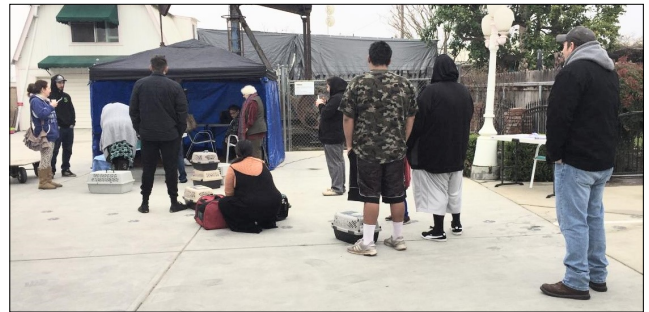
Waiting to be checked in.

We just booked our next clinic to hopefully get ahead of kitten season. The dates are March 8th - 10th. Appointments can ONLY be made two weeks before the March 8th date. Follow us on Facebook to keep apprised of future clinic dates. Each three-day clinic costs us $7,500.00, so donations are always needed!