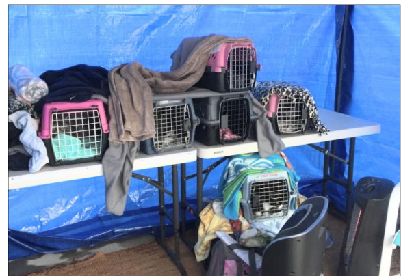
Kitties were put in a warm tent and covered to keep warm during recovery and before being taken home.