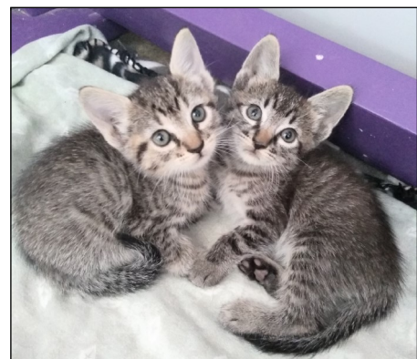
Two kittens saved from the park