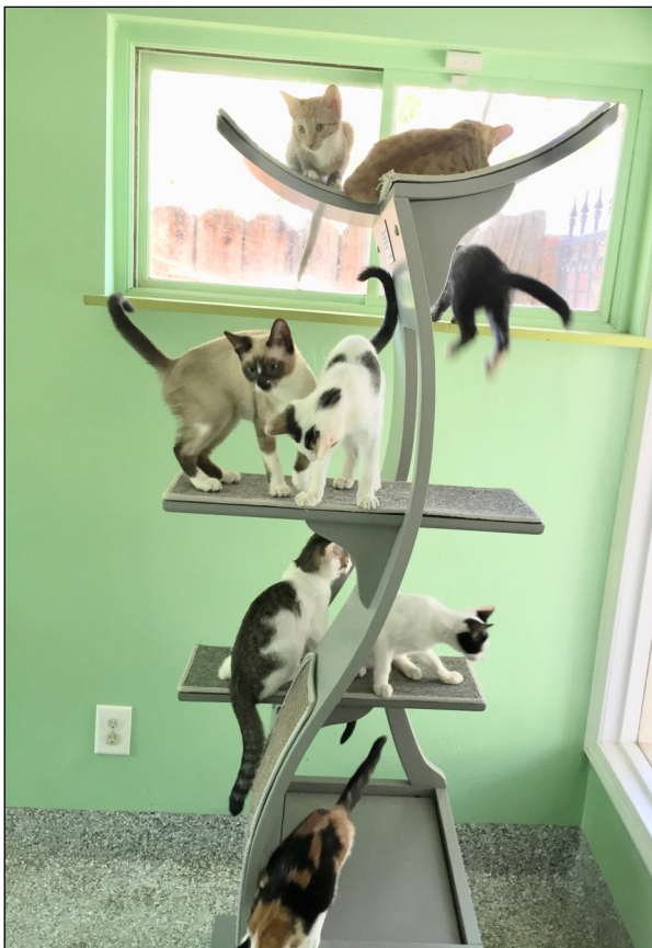
Kittens enjoying one of the cat trees

Through our Food Assistance Program in May, The Cat People gave out 325 lbs. of dry cat food, 72 cans of wet food and 34 containers of litter to 13 families who are having trouble feeding their kitties regularly. The following month, we distributed 700 lbs. of dry food, 168 cans of wet food and 68 jugs of litter to 28 households in need. In July, we handed out 325 lbs. of dry food, 78 cans of wet food and 32 cartons of litter to 13 recipients. Keep in mind that program participants pick up three months' worth of cat food and litter at a time now.