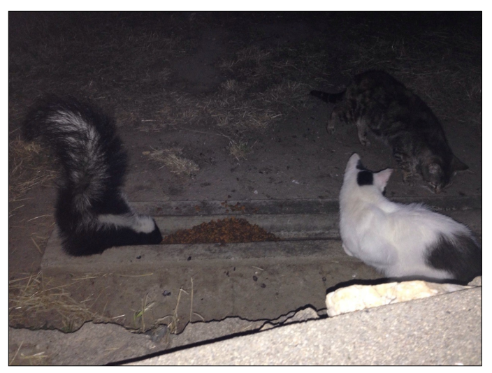
Park cats sharing their food with a skunk.