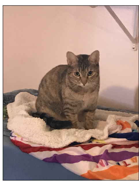
BB hanging in her new room.