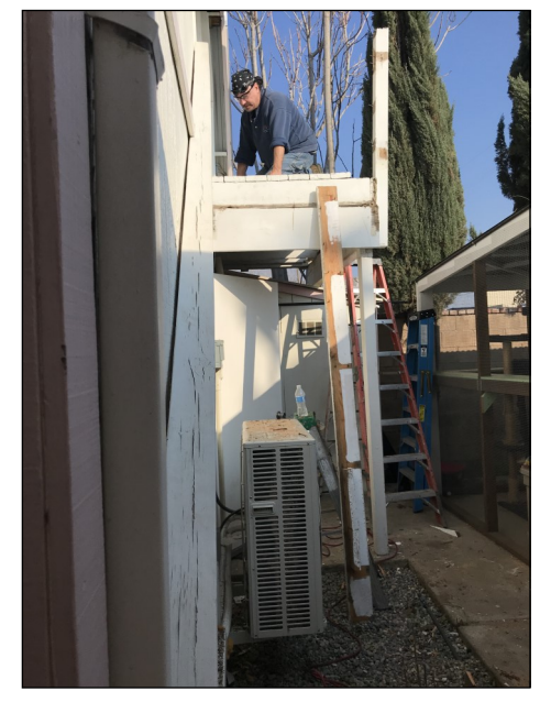
Old stairs and decking coming down.