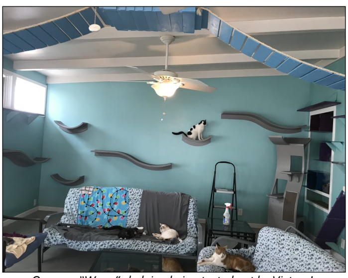
Our new "Wave" shelving being tested out by Victory!