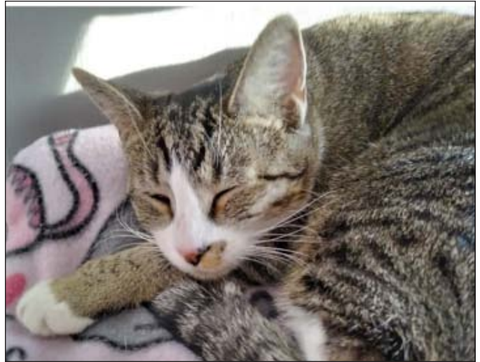
Sweet and loving, Mandy is about 7 months old and is available.

To contact any of the above personnel please call 327-4706