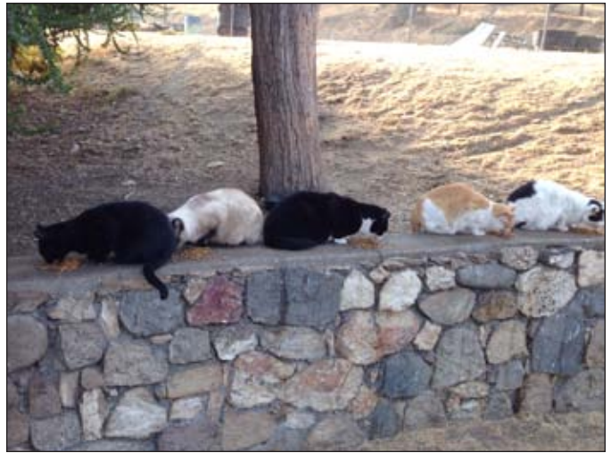
Kitties enjoying their breakfast at the Park.