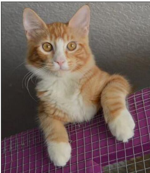
Harry is a teenager, sweet and affectionate, and would love to come to your place!