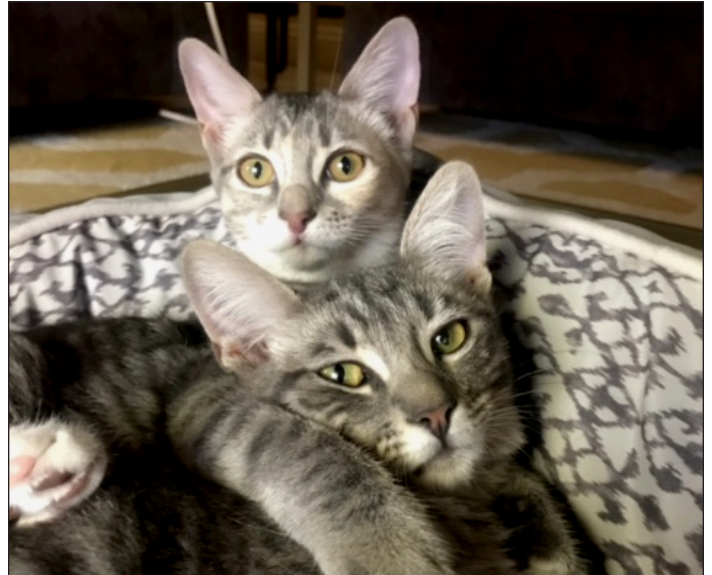
Ophelia and Lily, about 6 months old, are Park rescues and would like a home together.

Sadly, we lost our Aardvark, a sweet older black and white park feline living in the Purple room. He did not die alone and was loved on by all the volunteers. He is now over