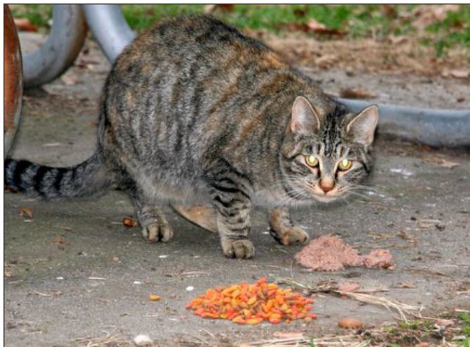
One of the Park cats, enjoying breakfast.