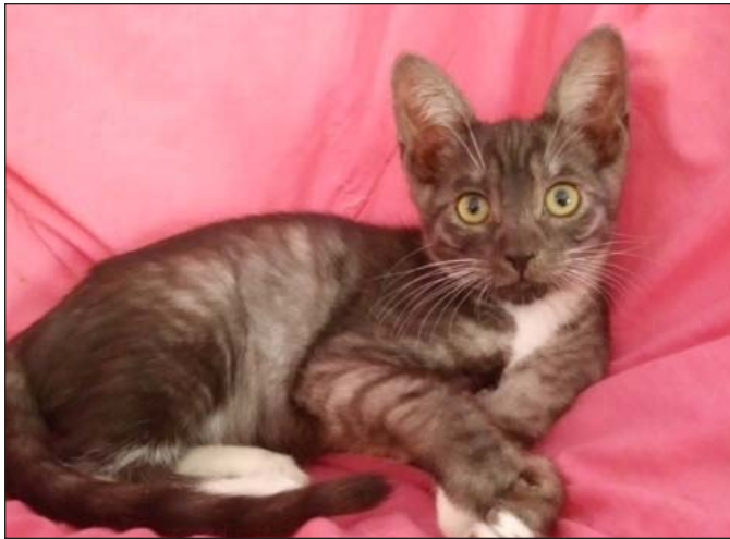
Boo is Bixby's brother. They are both sweet and playful and would love to be adopted together.