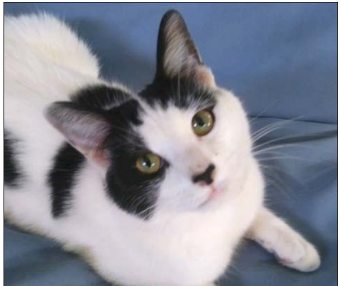
Victory, a cute 9-month-old, is a park rescue who would love to come and purr at your place.