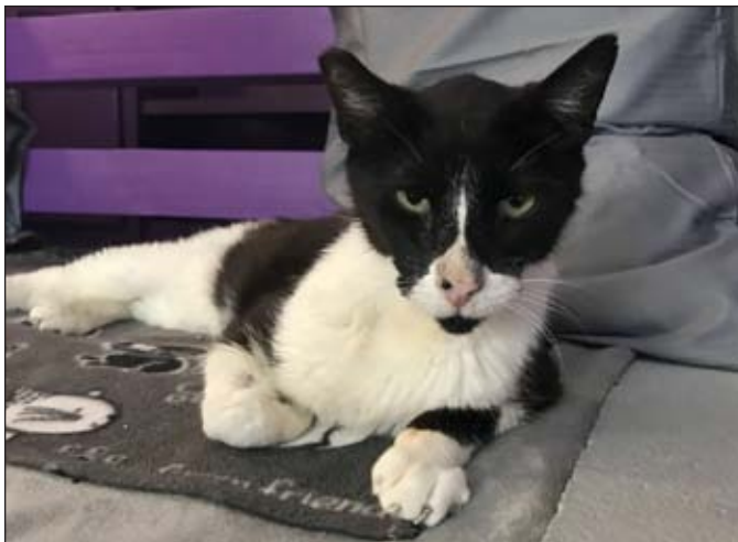
Aardvark, our 7-8 year old park rescue, is ready for his new home.