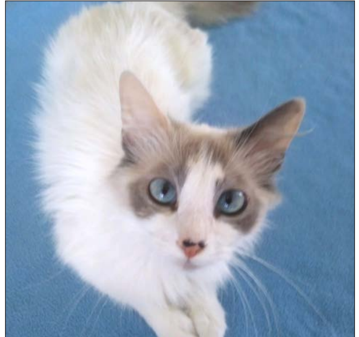
Greta, a pretty Siamese cross, dumped at the park with her babies, is looking for a home.