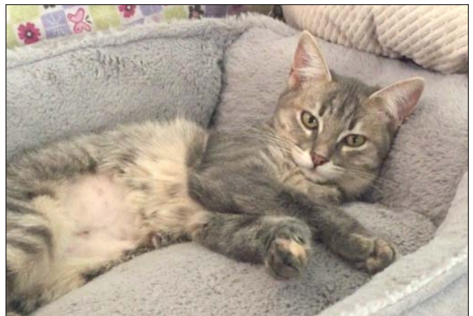
Suzie, a 5-month-old park rescue, is looking for a home.