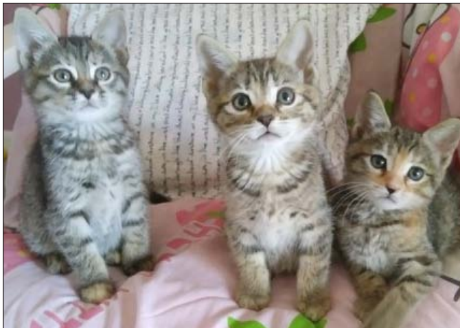
Rizzo, Riley and River were left at the park. They are ready to come and play at your house now!

Thanks to our great team of feeders, Auburn Animal Hospital, our foster families, and generous donations, at least these felines have support, love and the chance to find a forever home.