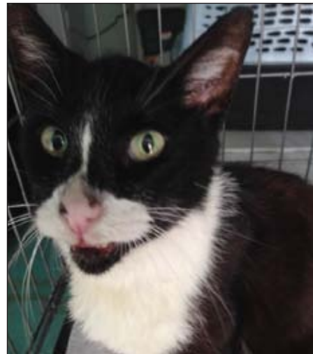
Aardvark, a 7-8 year old special rescue, would have died if left at the park. Several feeders chipped in to see that he got needed dental surgery and he is now safe and recovering. This guy deserves a nice, quiet home!