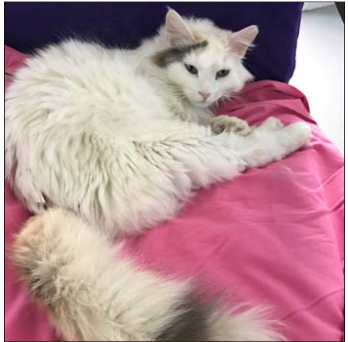
Beauty lived in a tree at the park for two years before we were finally able to bring her in.