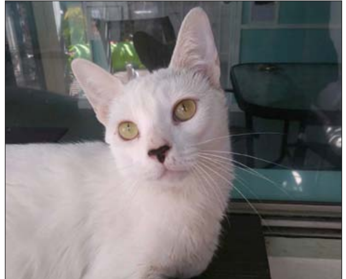
Beautiful Shelley has been waiting for a home for a long time. This sweet, well-mannered two-year-old is a park rescue and just wants to come and purr at your place!

We hope you will find time to visit us, whether it is attending a fundraising event, sitting with the cats, or lending a helping hand with future activities. Your support ensures that